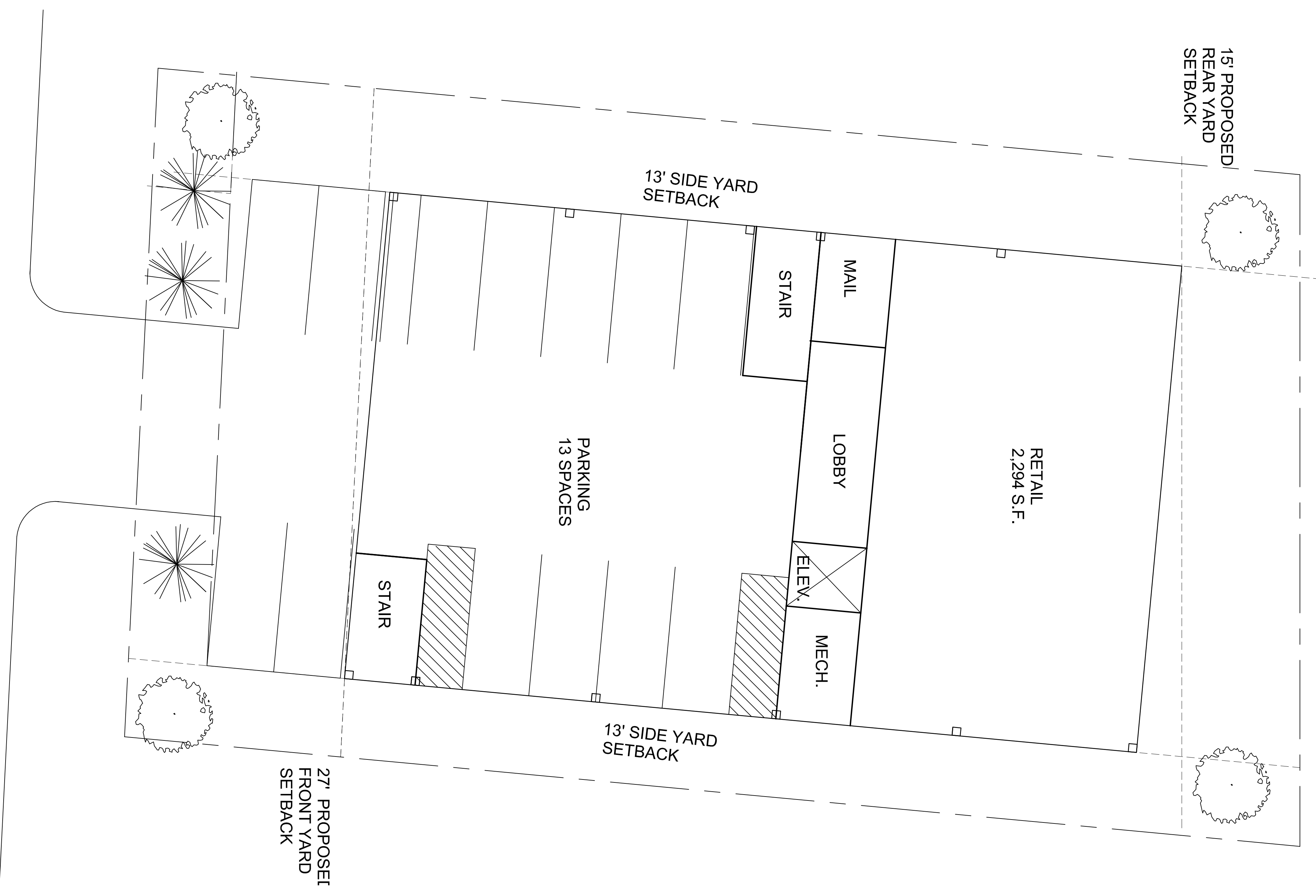
1 1ST FLOOR PLAN Scale: 1/8" = 1'-0"